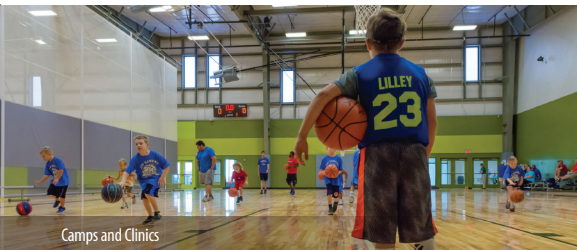
Camps and Clinics