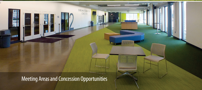
Meeting Areas and Concession Opportunities

The Salina Fieldhouse features more than 68,500 square feet of programmable space to encompass a wide variety of sports and events.